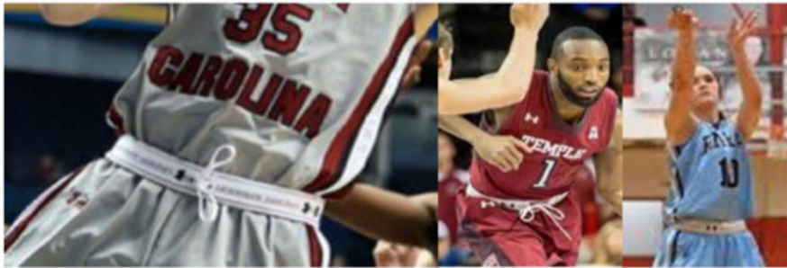
All of these rolled waistbands would be illegal because they either have exposed drawstrings and/or do not comply with restrictions on logos. Make certain that drawstrings are not exposed to prevent significant injury