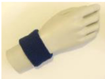
This wristband is legal and worn in a proper position. This must still comply with all color restrictions/requirements