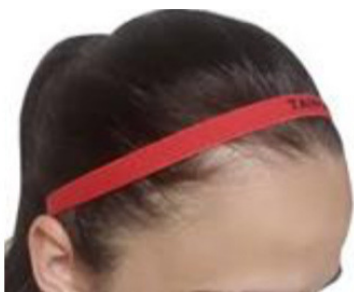
This is considered a headband and not a hair restraining device because it encompasses the entire head. It is legal but must still comply with all color restrictions/requirements