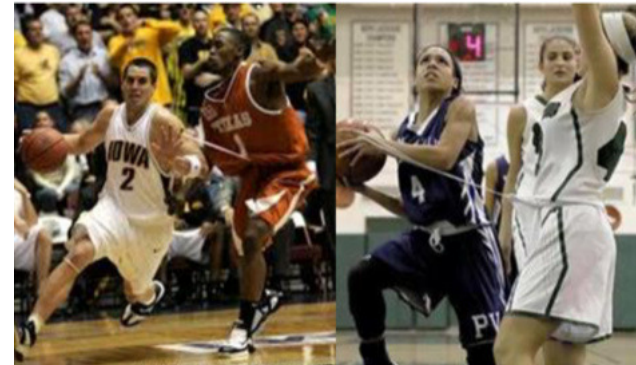
Make certain that drawstrings are not exposed to prevent significant injury