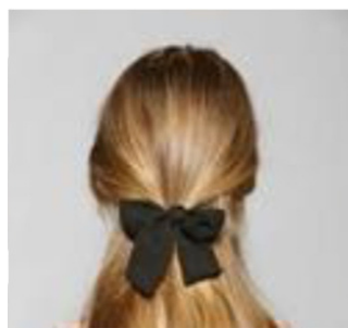
This bow used as a hair control device is legal because it is not considered a headband