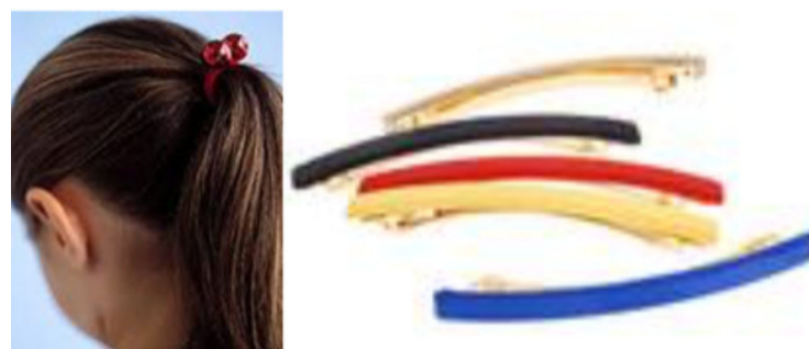
These hair control devices are illegal because they have components that are hard or sharp.