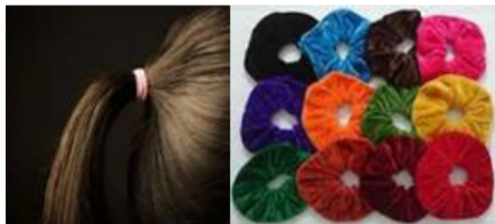
These hair control devices are legal . They are flexible and/or soft and are not subject to color restrictions/requirements.