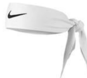
This headband is illegal as it appears. While the knot is okay, the tails are not. Not more than 3” wide Those extensions may be tucked into the band in order to comply with the rule