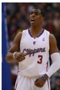
This player’s wristbands are illegal because they are not designed to absorb moisture and do not match in color